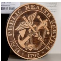
Centers for Disease Control and Prevention (CDC) – Seal Chain of Title